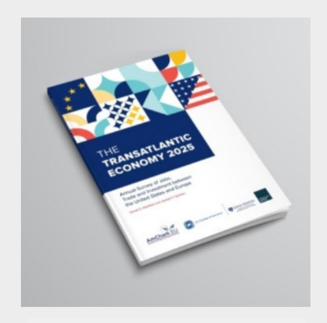
Transatlantic Trade and Investment 2025