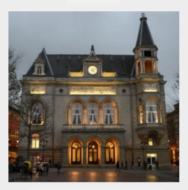
Thanksgiving Gala Dinner 2025