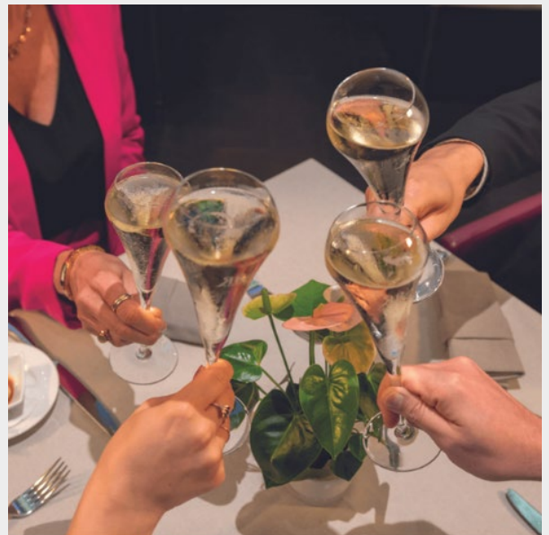
New Years Reception 2026