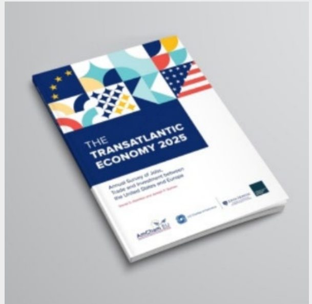
Transatlantic Trade and Investment 2025