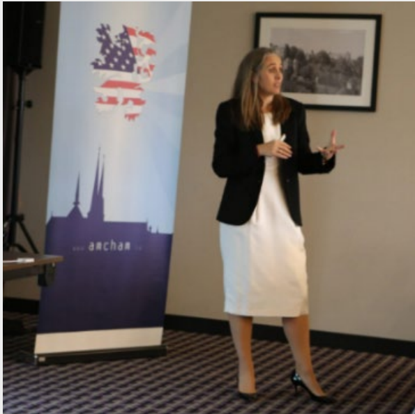
Amcham & BCC Personal Tax Event 2025