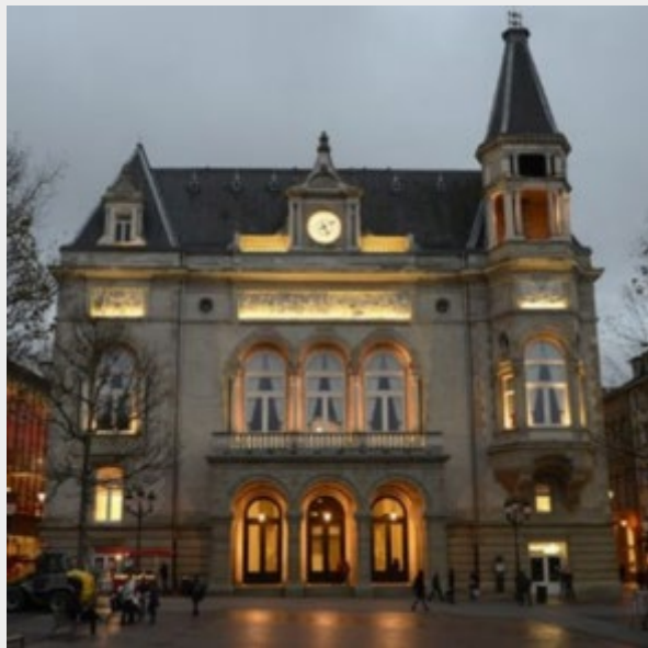
Thanksgiving Gala Dinner 2025