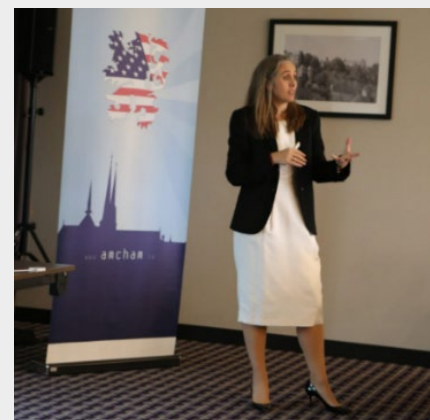
Amcham & BCC Personal Tax Event 2025