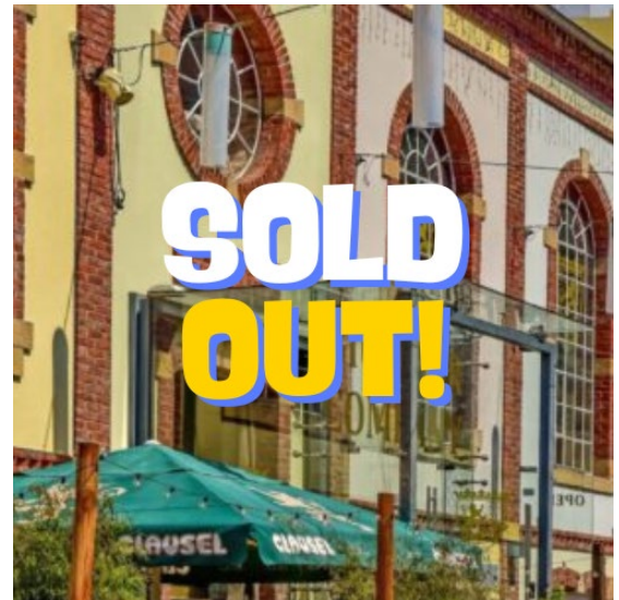
Summer BBQ Party | 06.06