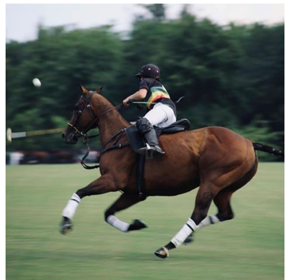
International Roude Léiw Polo Cup | 06-07.07