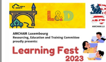
Learning Fest'23 Webinar Series is now online