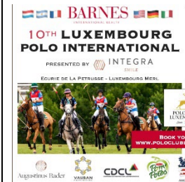
10th anniversary of the Luxembourg International Polo Tournament