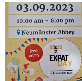
Expat Day 2023