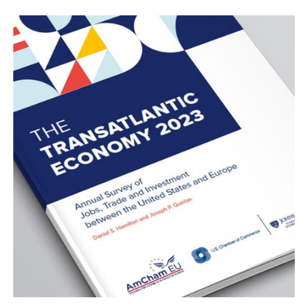
AmCham EU: Transatlantic Economy Report 2023