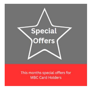
Special Offers from our Partners