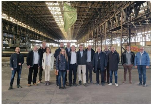
AMCHAM Real Estate Committee visits “Metzeschmelz”