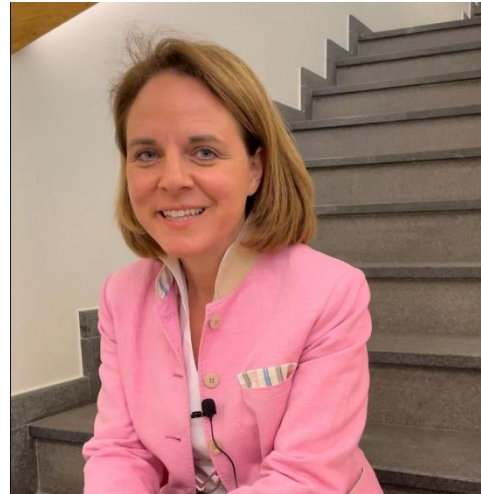
Voting: a 1-2-3 video guide in English