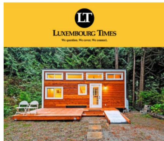
Luxembourg takes another step to promote 'tiny houses'