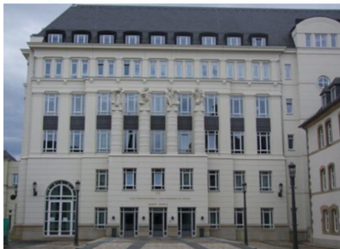
Trial In Absentia Against Former AMCHAM Employee