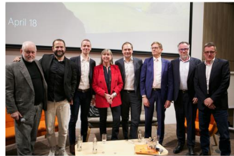
Photo album of ING Town Hall meeting