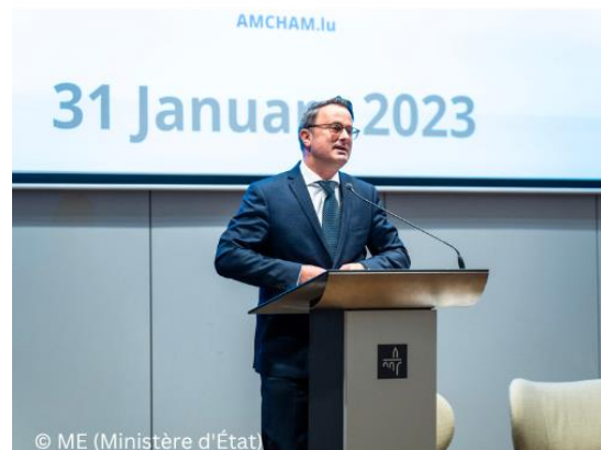
Photo highlights from the AMCHAM New Year's event sponsored by Spuerkeess & LaLux