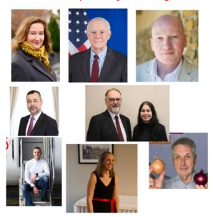
Thanks to our MBC partners With over 200 partners there are too many to list. Please select the image below for a full listing