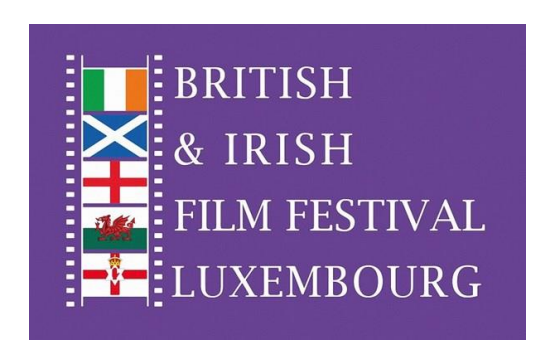
British & Irish Film Festival week!!