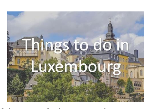
Things to do in Luxembourg