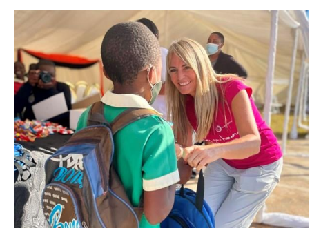
PM-International Visits Sponsored Children in Zimbabwe