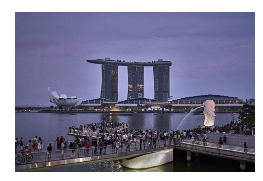
Singapore Hunts for Global 'Rainmakers' With New Expat Visa